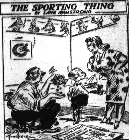
"Oh, hello, dear—er—ah—Junior and I have decided to take a fling at the ponies."