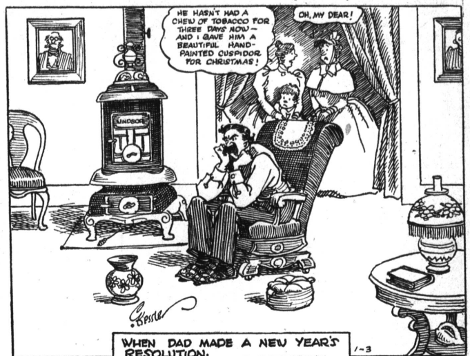
WHEN DAD MADE A NEW YEAR'S RESOLUTION.