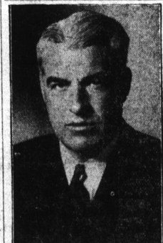
E. R. STETTINIUS, JR. Industry prays for peace

We look forward to the new Year encouraged by the substantial improvement which has taken place in the steel industry during the past four months. A sharp upward movement in steel operations began early in September, due chiefly to domestic demand for needs that had been accumulating for some time, with an added stimulus from increasing foreign inquiries.