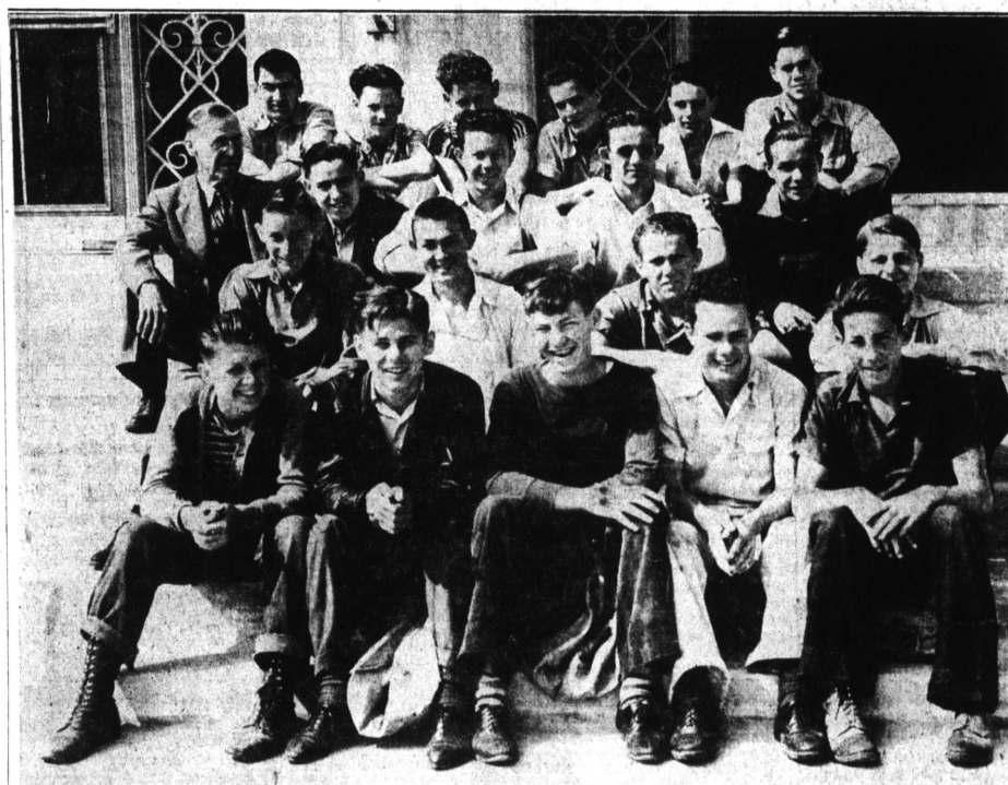
MEMBERS OF HERALD STAFF . . . This grinning group of young men was serving you as Herald carrier re-establishment of The Lomita News as a separate publication has necessitated adding five more boys and three boys in April. Since then, the increased circulation thru adults to the newspaper staff.