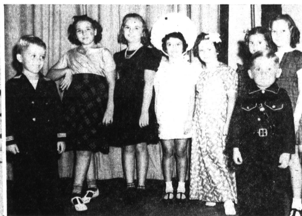
DURING FROLIC DAYS . . . The above are three scenes from the Factory Frolic of last September. At the left are the young winners of the Pet Parade, in the center are a group of prominent citizens essaying the hobby horses and at the right are local youngsters who served as models in the style show.