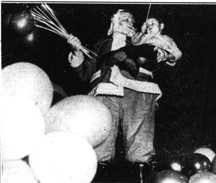
SANTA GETS ROYAL WELCOME . . . Standing in a bower of colored balloons, Santa rode into Torrance Dec. 1 on a fire truck to be welcomed by 19,000. He made a return appearance last Friday night when he distributed over 70 gifts before a crowd of a thousand or more.