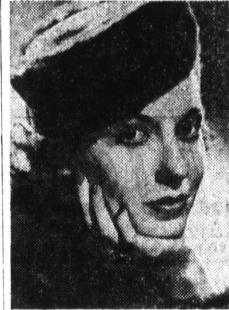
VALERIE HOBSON ... in grim wartime drama

The catastrophe now sweeping Europe is brought to vivid actuality on the screen of the Lomita theatre, where Columbia's "U-Boat 29" presents a stirring dramatic picture of a war-smitten England desperately battling enemy spies and submarines, starting tonight.