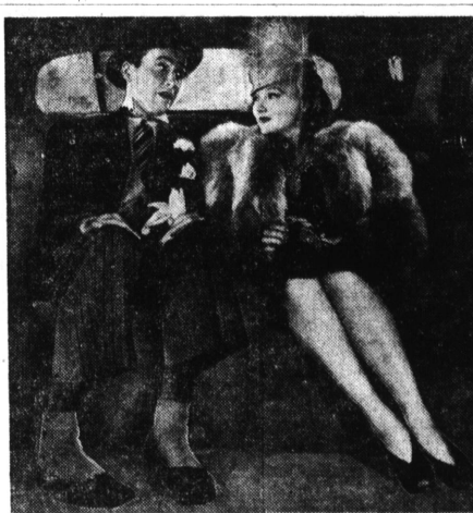
HE'S IN TROUBLE . . . A home-spun youth suddenly and bewilderingly appointed to the U. S. Senate, James Stewart immediately runs into trouble. Her name's Astrid Allwyn and she's Jean Arthur's romantic rival in "Mr. Smith Goes to Washington," opening Saturday at the Plaza theatre in Hawthorne.