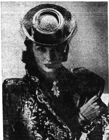
Of Suzy's cyclamen felt hat, chosen by December Harper's Bazaar to complete a black or dark blue outfit, it might almost be said: "Pancake style in layers."