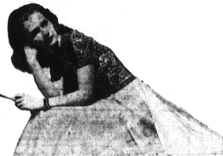
A STUDY in contemplation: Mrs. Orson Welles in blue margaiza with white skirt, as presented in Harper's Bazaar for December. Infinitely small black braid embroiders the long tight bodice.

Pies — Cakes — Rolls — Breads Sweet Rolls — Coffee Cakes — Donuts — Fruit Cakes — Cookies.