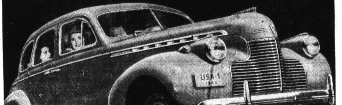
The Special De Luxe Sport Sedan, $802*

Chevrolet for '40 has hair-trigger getaway! Its Super-Silent Valve-in-Head Engine enables you to accelerate from 5 to 25 miles per hour with almost unbelievable speed! Its Exclusive Vacuum-Power Shift gives an exclusive kind of handling ease—its Perfect Hydraulic Brakes the very highest degree of safety! And in the combination of all these factors—in over-all performance with over-all economy—the motor world just doesn't hold its equal! Eye it . . . Try it . . . Buy it . . . and convince yourself, "Chevrolet's FIRST Again!"