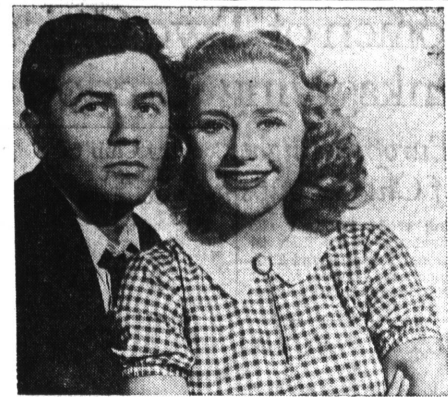
FIRST TIME TOGETHER . . . John Garfield and Priscilla Lane are co-starred together for the first time in "Dust Be My Destiny," which opens Sunday at the Grand theatre, Torrance.

Carelessness in working on disabled vehicles parked on highways of the state resulted in 176 persons being injured and 24 deaths in 1938, says department of motor vehicles.