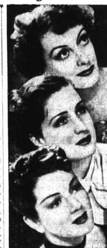
JOAN CRAWFORD, NORMA SHEARER AND ROSALIND RUSSELL