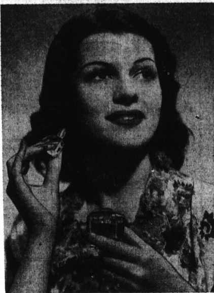
Just before slipping into her gown, RITA HAYWORTH applies an exquisite fragrance as the final touch to her grooming.