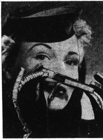
A purse-size flacon of worldly fragrance with a naughty name comes encased in a gay leather jacket which makes a welcome gift for modern belles.