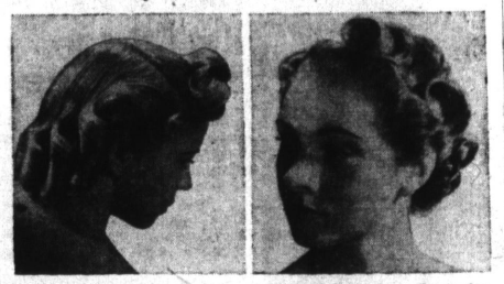
Two stunning coiffures designed by Leonore of New York, for "Beauty and You" readers