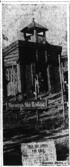
AT FAIR'S END . . . Now that the San Francisco world's fair is ended, you can buy this Norwegian ski lodge at bargain rates, with or without furnishings. It was built in Norway and reassembled on the island.

SHOES DYED ANY COLOR FOR FALL WEAR! KENNY'S SHOE REPAIRING AND FOOT CORRECTION NOW BACK AT OUR ORIGINAL LOCATION 1917 Carson St.