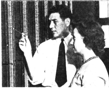
OPEN DURING FROLIC

COUNTY CAR TOTAL Los Angeles county has more motor vehicles registered than Washington, Oregon, Arizona and Nevada combined.