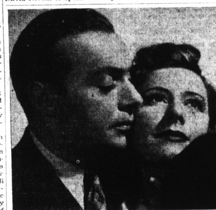
ROMANTIC STARRING TEAM . . . Charles Boyer and Irene Dunn are shown above in an intimate scene from their latest starring production, "When Tomorrow Comes," opening Sunday at the Plaza theatre in Hawthorne.