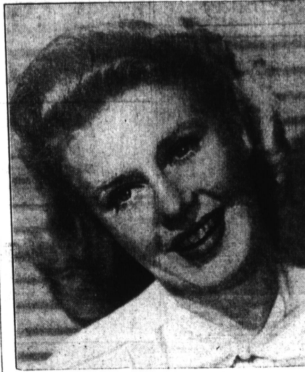
GINGER'S A "MOTHER?" . . . Circumstantial evidence that points to Ginger Rogers as the mother of an abandoned baby is the basis for much of the comedy in the titian-haired star's current vehicle, "Bachelor Mother," co-starring David Niven. It opens Sunday at the Lomita theatre.