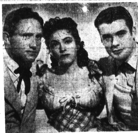
IN DARKEST AFRICA . . . Declared by critics to be the most engrossing film narrative screened this year, "Stanley and Livingston," starring Spencer Tracy, Nancy Kelly and Richard Greene, opens tonight at the Grand theatre.