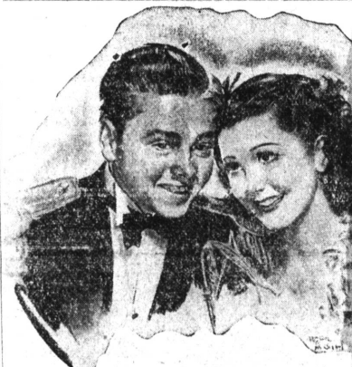
ANDY APPEARS IN LOVE AGAIN . . . in the of the now famous Hardy Family series, starring Rooney and Lewis Stone. The new picture is "A Gets Spring Fever," a riot of young goings-on a parental admonitions in which Andy Hardy brings the house as the leading character in a high speed film screens Sunday, Monday and Tuesday Plaza Theater, Hawthorne, together with Sidney "Charlie Chan in Reno."