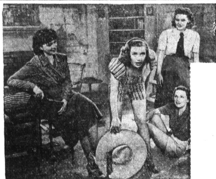
"DAUGHTERS COURAGEOUS" . . . feature Lane Sisters shown in the scene above comes to U. Theatre, Torrance beginning Sunday, Sept. 2, with tinuous show Monday, Labor Day.

WEDNESDAY TO SATURDAY, SEPTEMBER 6, 7, 8, 9 with SHIRLEY TEMPLE "Susannah of the Mounties" ALSO with VIC McLAGLEN "CAPTAIN FURY"