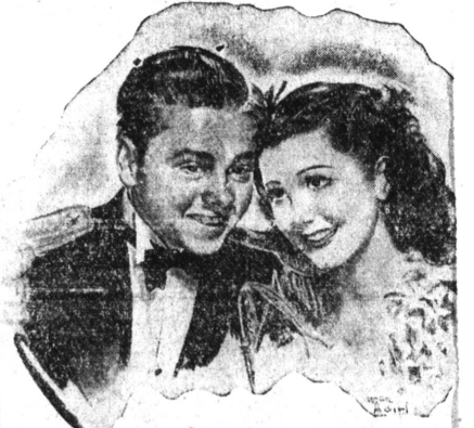
ANDY APPEARS IN LOVE AGAIN . . . in the scene of the now famous Hardy Family series, starring Mickey Rooney and Lewis Stone. The new picture is "Andy Gets Spring Fever," a riot of young goings-on and parental admonitions in which Andy Hardy brings the house as the leading character in a high school. The film screens Sunday, Monday and Tuesday at Plaza Theatre, Hawthorne, together with Sidney Toler in "Charlie Chan in Reno."