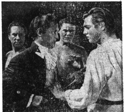
"MUTINY ON THE BOUNTY" starring Franchot and Clark Gable is the stirring headline attraction at Torrance Theatre next Sunday, Monday and Tuesday.