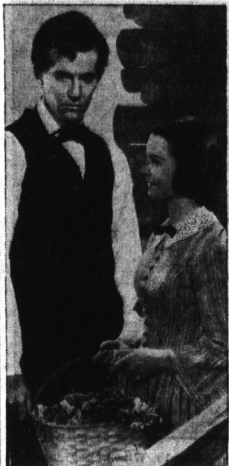
ABE AND ANN ... Lovely Ann Rutledge (Pauline Moore) was the first love in the life of young Abraham Lincoln (Henry Fonda). The gripping drama of the Emancipator's youth opens tonight at the Lomita theatre.