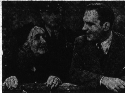
MEETING BEST PEOPLE... May Robson and Pat O'Brien agree you meet the best people in night court in this scene from "The Kid from Kokomo," showing at the Plaza theatre starting Sunday.