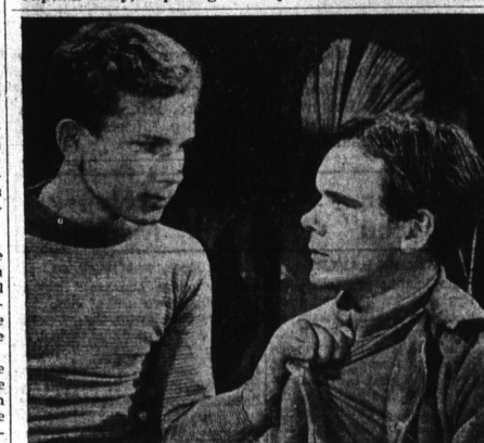
METROPOLITAN MADNESS... Two of the "little tough guys" that make "Code of the Streets" a vivid drama of city life from the slums to the snuggeries are shown here. This unusual feature opens tonight at the Torrance theatre on the same program with John Wayne in "New Frontiers."