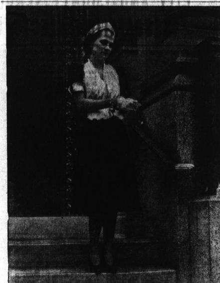
A black, imported linen dress with detachable bib and cuffs is suggested by Good Housekeeping magazine as the answer to the career girl's summer problem.