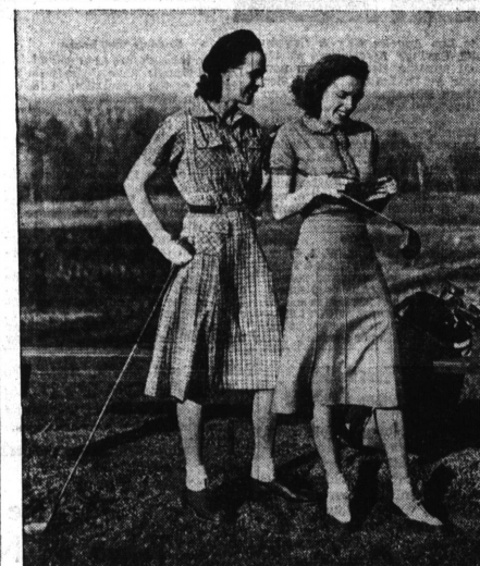
For summer-resort golf or general wear, Good Housekeeping magazine features the plaid seersucker dress at the left and the flannel umbrella skirt with matching wool-jersey sweater.

HOUSES FOR RENT — READ THE CLASSIFIED PAGE