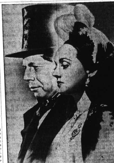
MEXICAN HISTORICAL FIGURES... Paul Muni and Bette Davis are co-starred in "Juarez," one of the truly outstanding screen productions of the current season which opens Sunday at the Torrance theatre. On the same program will be "King of the Turf" with Adolphe Menjou.