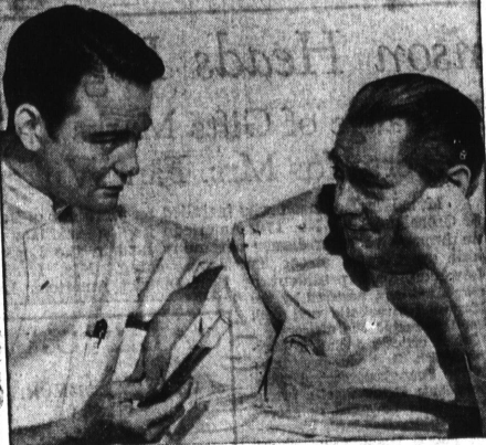
LATEST IN KILDARE SERIES... Lew Ayres and Lionel Barrymore are featured in the newest screen episode of medical lore, "Calling Dr. Kildare," now showing at the Plaza theatre in Hawthorne.

"Man About Town" PLUS "Charlie Chan in Reno"