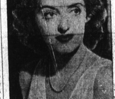
BETTE DAVIS... presents a scintillating performance in her newest picture, "Dark Victory," the story of one who searched a lifetime for love. It opens Sunday at the Lomita theatre.

Now for a word of warning: Be careful what you buy from fellows on the street. Many are phonies and work on out-of-towners. Yesterday when I drove down to see the Queen Mary sail for England, a fellow, noting my California plates, tried quite hard to sell me a Silver Fox fur that his department store had placed in his car by mistake. A little farther on I noticed another fellow trying to sell, at a tremendous discount, a bottle of imported perfume that had been sneaked into this country by a friend who worked on a boat. Of course both the articles and the stories were phoney. So if