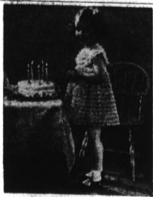
Social life begins at five and it begins auspiciously according to the July issue of Good Housekeeping Magazine, if the young lady wears this party dress made of rows and rows of lace posed over a rayon satin slip. The slip comes in pink, blue or white and the dress is tied with a big bow to match the slip. The bow in her hair also matches. Underneath the dress are fine party undies, panties trimmed with lace and satin ribbons.