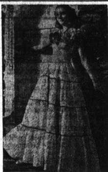
STRAIGHT out of a daguerrotype is this innocent dancing dress of dotted swiss, trimmed with rickrack and frothing with ruffles for a young girl's first parties, highlighted in Good Housekeeping Magazine.

The Small Store We Give J.N. Green Stamps LESLIE L. PRINCE, Prop. Gramercy and Cabrillo Ph. 180