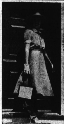
CRISP dotted swiss with embroidered batiste collar and cuffs is Good Housekeeping's choice for summertime luncheon parties. Pictured in the July issue.