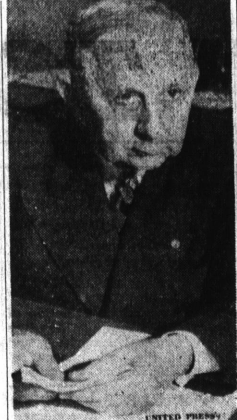
NEW ABA CHIEF ...

Travelers on ancient highways were often protected by a "blessing" placed upon the road and respected by persons dwelling along the route.