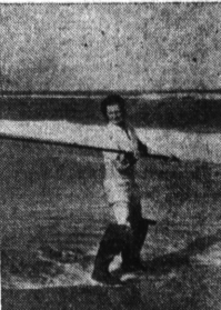
Surf Casting in High Boots, New Jersey.