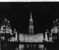
Treasure Island, San Francisco's World's Fair.

SUBSCRIBE TODAY! The Torrance Herald carries all the news. Don't be an "outsider"—Subscribe today!