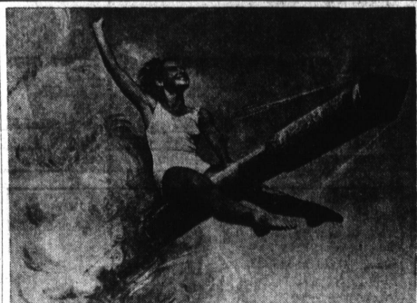
PIER PYROTECHNICS . . . She's riding high on one of the mammoth skyrockets scheduled

The Greatest of the Series "CALLING DR. KILDARE" with Lew Ayres and Lionel Barrymore