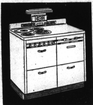
THE HOTPOINT SALISBURY. A de luxe range at a moderate price. Three colored units, built-in oven, warming oven and two utility drawers. Equipped with lamp, timer-clock and condiment set.

The joy of a cool, immaculate kitchen is something to think about with summer coming on. With an electric range, meals are really a pleasure to prepare. That's because the electric oven is completely sealed and insulated so no heat can escape. Surface units transfer their heat directly to the utensil without waste or heat loss.