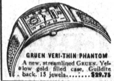
GRUEN VERI-THIN PHANTOM A new, streamlined Gruen, Yellow gold filled case, Goldtone back. 15 jewels. . . . $39.75

The Gruen Veri-Thin is amazingly thin, yet sturdy and accurate with FULL-SIZE working parts. . . insuring pocket-watch accuracy and ruggedness! Come in and see the new Gruen Veri-Thin Today!