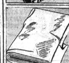
Standard Unbleached MUSLIN

Jacquard and Indian design blankets. Ideal for camps, picnics, beach and home use. In a convenient size, 70"x80". Plaid, too!