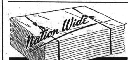
Our Famous Nation-Wide® SHEETS

A new low price for our fine quality Penco® sheets—they were big buys even at their former price! Laboratory tested! With an added refinement of finish. They'll give wonderful service, complete satisfaction. *Reg. U. S. Pat. Off.