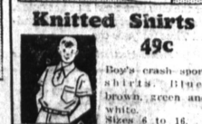
Knitted Shirts 49¢

Don't miss this sensational bargain! A good firmly woven quality for many sewing and household uses. 36" wide. Practical! Durable!