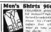
Men's Shirts 98¢

Boys' crash sport shirts. Blue, brown, green and white. Sizes 4 to 16.