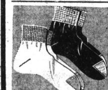
A Lot of Quality for Little Money!

Dainty, yet serviceable! Well tailored of sheer knitted rayon—they're comfortably cool for summer! Real values.