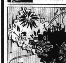
All Rayon! Washable!

Serviceable broadcloth, roomy sized! First colors, 2-button yoke fronts, elastic sides. Values!