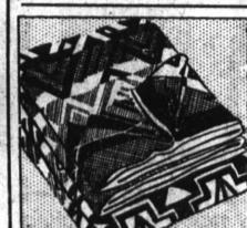
A Big Summer Value!

The lowest price in years on our popular Nation-Wide® sheets! Practical, long wearing quality. They're real buys at this bargain price! Stock up and save! *Reg. U. S. Pat. Off.