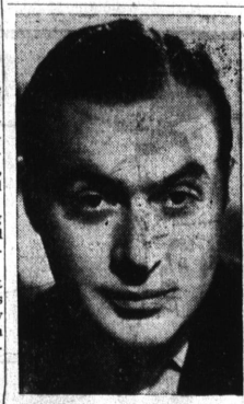
CHARLES BOYER . . . and Hedy Lamarr are co-starred in "Algiers" which is showing for the last times tonight at the Grand theatre here.

A spooky mystery drama in three acts, "The Dark House," will send shivers thru the spines of those attending the presentation of the Narbonne Senior class play tomorrow (Friday) night at 8 o'clock in the school gymnasium. The production is said to be the most ambitious stage attempt yet to be made at the Lomita school.