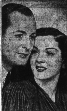
CO-STARS . . . Robert Montgomery and Rosalind Russell are featured in the romantic comedy, "Fast and Loose" which is now showing at the Lomita theatre in conjunction with "Huckleberry Finn."