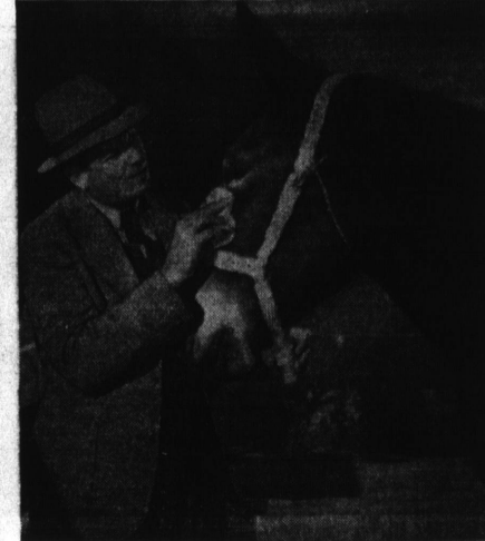
TWO MISSOURIANS ... Bob Burns and another Missourian in "I'm From Missouri" now playing at the Torrance theatre. The companion feature is "Boy Trouble" with Charlie Ruggles and Mary Boland.

National Purchasing Agents' convention in San Francisco this week.