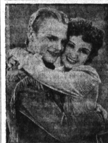
CAGNEY AND LANE

"The Oklahoma Kid," starring James Cagney and Rosemary Lane, is now showing at the Lomita theatre in conjunction with "Wife, Husband and Friend," a romantic, hilarious comedy featuring Warner Baxter and Binnie Barnes. Cagney's Western production has won wide acclaim for its many thrilling sequences, based on the Oklahoma land rush.