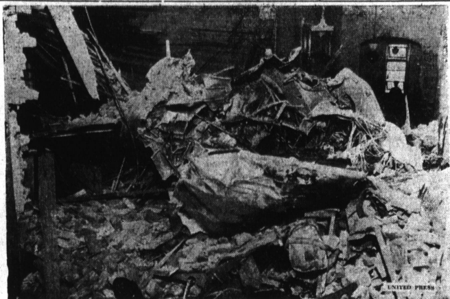
PLANE HITS OBSERVATORY ... Here is the wreckage of an army pursuit plane which crashed into the administration building of the Lick Astronomical Observatory atop Mount Hamilton, near San Jose, killing the two occupants of the plane.