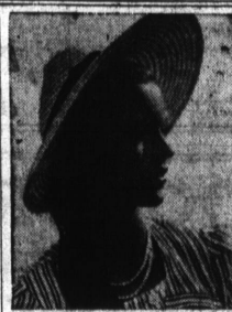
A LITTLE GIRL bonnet of white straw with long ribbon streamers, as highlighted in Harper's Bazaar for May.

A treaty of friendship and non-aggression exists among the western Asiatic powers of Turkey, Persia, Irak and Afghanistan.