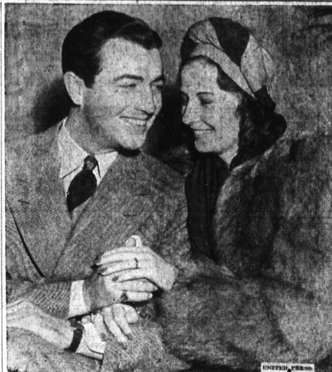
THEY'RE MR. AND MRS. NOW... Hollywood's newest No. 1 Newlyweds, Mr. and Mrs. Robert Taylor, pose for the press, after an elopement to San Diego, in the residence of Barbara Stanwyck, the bride, where they are making their home.

AUTO SUPPLY & SERVICE STORES CRAVENS and MARCELINA Torrance Ph. 476