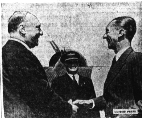
GOEBBELS IN YUGOSLAVIA ... Emissary for Chancellor Hitler in the efforts of the Rome-Berlin axis to tighten its fences, Germany's Propaganda Minister Joseph Goebbels, right, is greeted in Belgrade by Yugoslavia's foreign minister, Dr. Cincar-Markovic.

AMARILLO, Tex. (U.P.) — A fly-casting hotel burglar got $60 with his sport in two hotels here. The thief's method was to find a room with an open transom, in which the occupant was asleep. He climbed deftly onto the doorknob and stuck his head, shoulders and fly-rod through the transom. Then the fly-rod went to work.