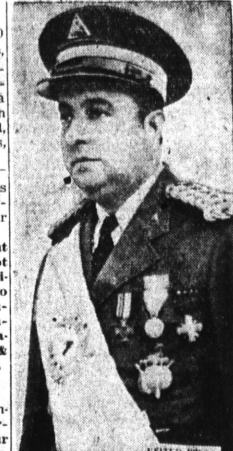
WHITE HOUSE BOUND ... Enroute to a White House call tomorrow is President Anastasio Somoza of Nicaragua.