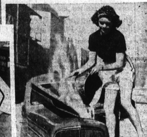
"Fan belt must be slipping, or maybe the radiator's clogged up." (?)