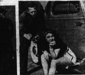
"Gears broken, and bearing burned out? Why didn't I have the grease and oil checked?"

housings are warnings of trouble ahead. These housings should be promptly flushed to avoid breakdown and expensive repair bills. Free inspections of these car parts constitute an important part of Summerizing."