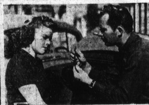
"So, it's the spark plugs now! What a life!"