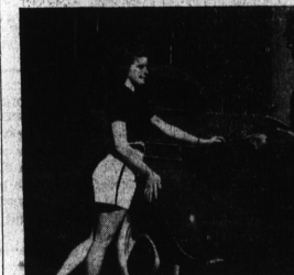
"Light's out, lady. You should have them inspected."