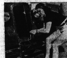
"Now what? Battery's too weak to turn her over."