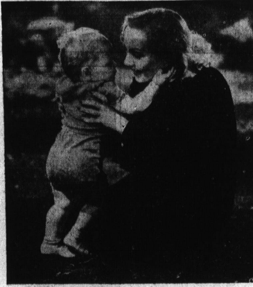
MOTHER AND CHILD ... Carole Lombard plays the role of a young, modern-day mother in "Made for Each Other," in which she is co-starred with James Stewart. This human drama starts Sunday at the Plaza theatre in Hawthorne.

TORRANCE THEATRE Phone Torrance 132 ADULTS... 25c CHILDREN... 10c NOW — ENDS SATURDAY ELEANOR POWELL ROBERT YOUNG BURNS & ALLEN "HONOLULU" — Together with — FLORENCE RICE UNA MERKEL "4 GIRLS IN WHITE" COME EARLY DOORS OPEN 6 P. M. Sunday, Monday, Tuesday... "YES, MY DARLING DAUGHTER" with Priscilla Lane — Jeffrey Lynn — May Robson Roland Young — Fay Bainter — ALSO — "Duke of West Point" LOUIS HAYWARD, JOAN FONTAINE, TOM BROWN Wednesday Only... FREE! NEW 1939 CAFFERS & SATTLER GAS RANGE!!! — ON THE SCREEN — "NANCY DREW, REPORTER" and "PARDON OUR NERVE"