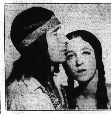
One of the most beloved romances ever written, "Ramona" vivid outdoor play of early California, soon will be presented to the public for the sixteenth season. The people of Hemet and San Jacinto in Elverdado County will offer the eighty-fourth performance of Ramona Saturday, April 22.