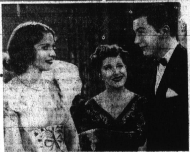
MUSICAL HURRICANE ... A madcap comedy as captivating as a South Seas moon is "Honolulu" which opens tonight at the Torrance theatre with "Four Girls in White" as the second feature. Starring in the musical romance is the above trio—Eleanor Powell, Grace Allen and Robert Young.