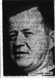
LICENSE DRINKERS? ...