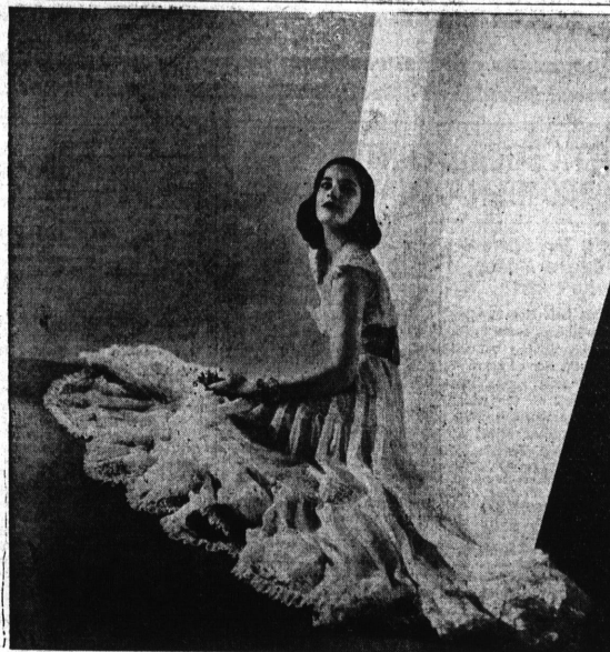
LOVELINESS IN LACE . . . A lace "baby dress" exuding warmth and luxury and befitting a youthful splendor, is featured in the March Harper's Bazaar. Row upon row of fine white Chantilly