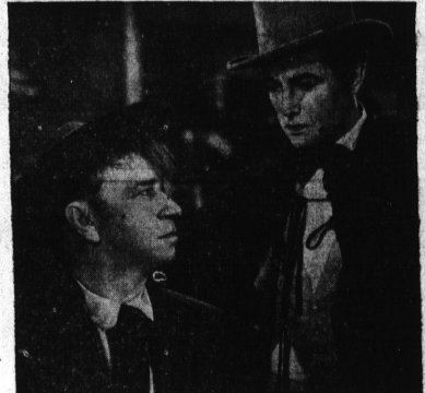
THEY PULL NO PUNCHES... Wallace Beery and Robert Taylor stage some vigorous battles and considerable comedy in their picture, "Stand Up and Fight," which opens Sunday at the Plaza theatre in Hawthorne.

MULLIN'S SERVICE 2053 Torrance Blvd. Phone 320-J