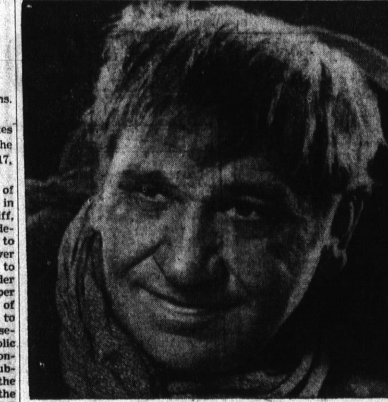
FITS HIS MIDDLE NAME... "Bad Man" is Wallace Beery's middle name as far as his screen characterizations are concerned. In "Stand Up and Fight," opening at the Torrance theatre Sunday, he appears in the greatest "bad man" role of them all as Boss Starkey, manager of a Maryland stage coach transportation line who attempts to drive out a competing railroad line. Robert Taylor co-stars in the new picture, with Florence Rice providing the feminine interest.

"I believe these acts refer to the dam as 'Hoover Dam' (see 46 stat. at large 1146:47 stat. at large 118: and 47 stat. at large 535). Moreover, the dam is referred to as 'Hoover Dam' in the contract between the United States and the Metropolitan Water District under which contract, I understand, the dam is actually being constructed. Our department was not aware that you had officially rechristened the dam, and that had been any change in its technical name since the order of Secretary Wil-