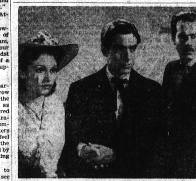
IN VIVID ACTION DRAMA... The three leading roles in the spectacular production, "Jesse James," that opens tonight at the Gardens theatre, are taken by Nancy Kelly, Tyrone Power and Henry Fonda, shown above in a scene from the fast action drama of the mid-west.