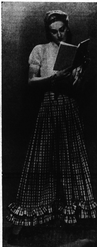
FOR flaming spirits and dancing hearts Harper's Bazaar presents in the March issue Chané's famous gypsy dress with red plaid taffeta skirt and a blouse of chiffon and lace.