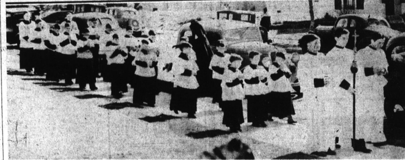
Altar Boys Lead Procession of Priests from Parish house on Engracia into New Catholic Church