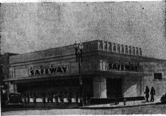
Safeway's newest and largest store, opening today at Sartori and El Prado