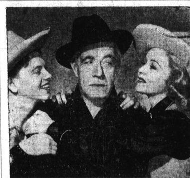
HARDY FAMILY GOES WEST . . . The latest comedy adventures of the Judge Hardy family are depicted in "Out West with the Hardys," which opens tonight at the Torrance theatre. Shown above are Mickey Rooney, Lewis Stone and Cecelia Parker in a scene from the film.

Kite flying, traditional New Year's sport of Japanese boys, has been banned because of "the emergency," the Chinese war.