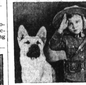
TWO IMPORTANT actors in "Heart of the North"

Produced on the lavish scale characteristic of all Warner Bros. Technicolor specials, the picture