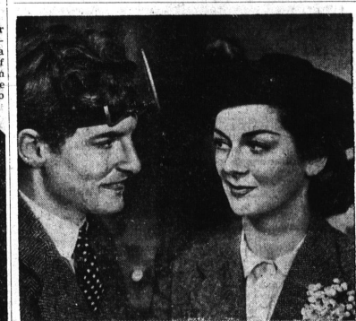
NOVEL FAITHFULLY SCREENED . . . "The Citadel," based on the novel by A. J. Cronin, which has been widely acclaimed, comes to the Plaza theatre in Hawthorne starting tonight. Robert Donat and Rosalind Russell (above) play the roles of the heroic young doctor and his schoolmistress wife.