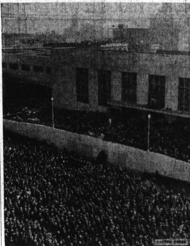
Thousands of commuters, eager to save an average half-hour of traveling time each day—but sorry to see the end of slower although colorful ferryboats, jammed the new San Francisco-Oakland Bay Bridge Terminal in San Francisco. Note Bay Bridge in background, over which the trains cross on a lower deck.