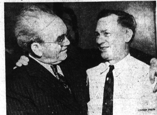
One of Tom Mooney's first acts after his pardon by Governor Olson of California was to visit Warren K. Billings, right, at Folsom Prison. Mooney pledged himself, on acceptance of the pardon, to work for the release of Billings, who was convicted with Mooney in the 1916 San Francisco Preparedness Day bombing.