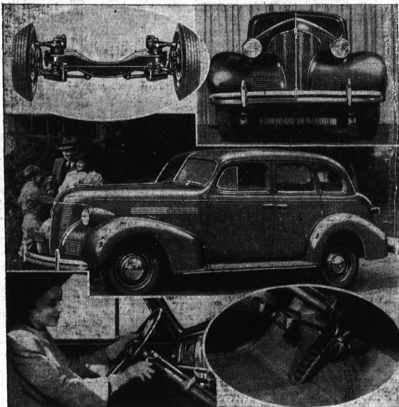
New Aero-stream styled bodies combine with major mechanical improvements to provide new beauty, safety, comfort and operating ease in the 1939 Chevrolets, presented October 22, and featured at the big auto shows this month. The new models are offered on two chassis, the Master De Luxe and the Master 85, both of which are powered with Chevrolet's famous six-cylinder valve-in-head engine. A new vacuum gear shift mechanism with steering column control, optional on all models at small extra cost, does 80 per cent of the work of shifting gears. The Master De Luxe series features a new riding system, in which a brand new Chevrolet Knee-Action mechanism is scientifically co-ordinated with new ride stabilizer and double-acting hydraulic shock absorbers to furnish a smooth, soft ride. Central picture is the new Master De Luxe Sport Sedan. Upper right: front right view of the 1939 car; Upper left: Master De Luxe front suspension unit, complete; Lower left: accessibility and finger-tip ease of operation are two major features of Chevrolet's vacuum gear shift with steering column control; Lower right: As the handbrake on all models is relocated under the cowl, front compartment floor is cleared in cars with vacuum gear shift.

groups. Sinclair also favored the self-help idea with the idea of abolishing direct relief, in the hope of lightening the burden on taxpayers. But Sinclair's ultimate aim was toward elimination of the profit motive. Olson has stated this objective is not his intention.