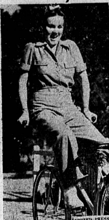
Deanna Durbin, 15-year-old singing star at Universal studios, is mastering some fancy tricks on the bicycle given to her by Producer Joe Pasternak.