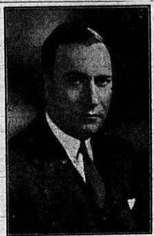
BENJAMIN F. FAIRLESS ... four problems cloud future

Taxi Politeness Decried SALINAS, Cal. (U.P.) —Politelyness from a taxicab drivers or revocation of license is the edict of the city council here.